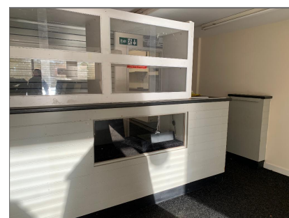
Front Counter Area