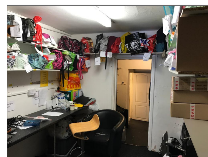
Back Office/Retail Space (when occupied)