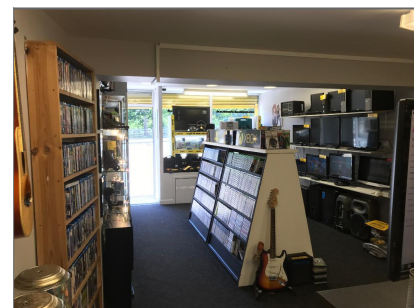
Front Shop/Retail Space (when occupied)

Rear Retail/Office Space - 14' 4" x 10' 1" (4.38m x 3.09m) A smaller retail/office space - currently with shelving to walls - permission to carry out alterations to