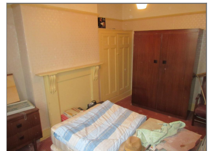
Bedroom 1 (Double)