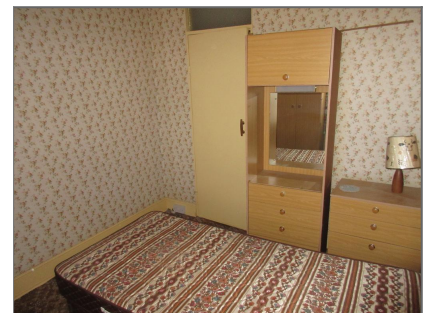
Bedroom 2 (Double)